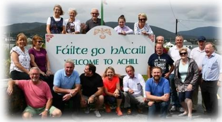
Club members on our recent trip to the west of Ireland!